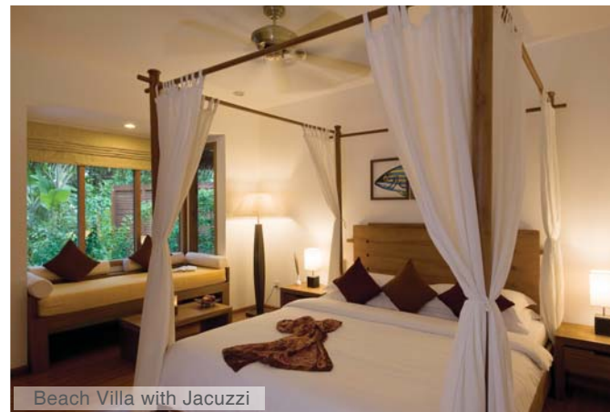
Beach Villa with Jacuzzi