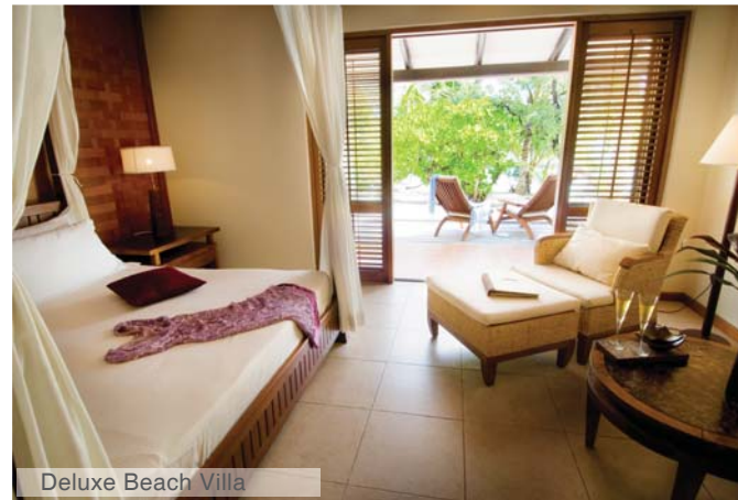
Deluxe Beach Villa