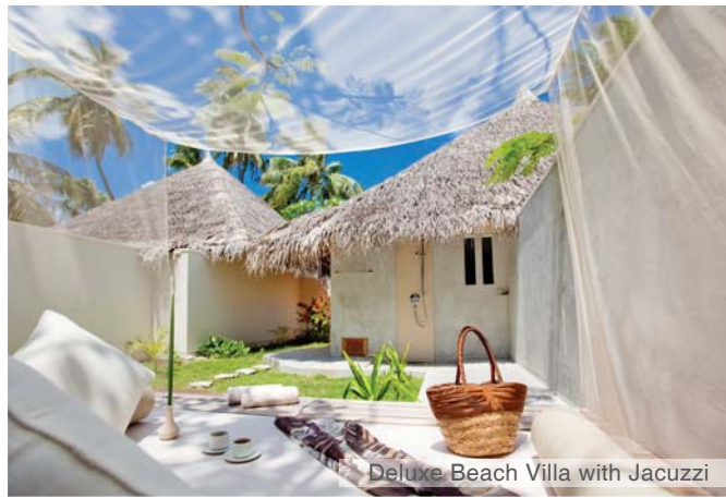
Deluxe Beach Villa with Jacuzzi