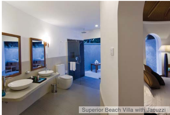
Superior Beach Villa with Jacuzzi