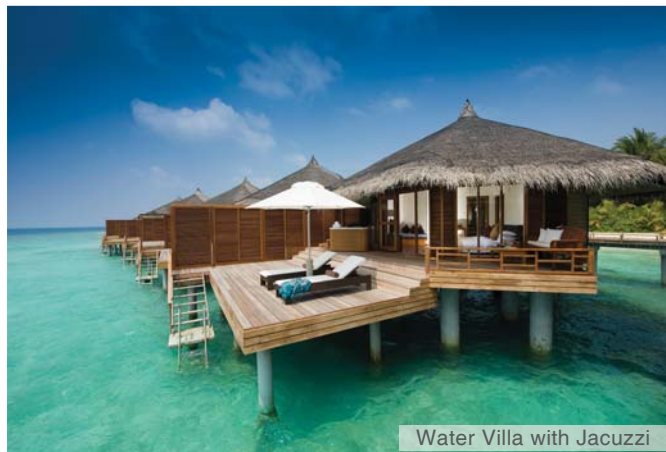
Water Villa with Jacuzzi